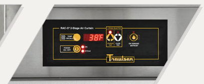
DIGITAL THERMOMETER DISPLAY

12 gauge stainless steel .320 diameter door pins