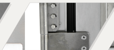
STAINLESS STEEL HINGES

12 gauge stainless steel .320 diameter door pins