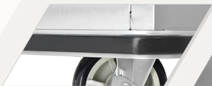
FULL PERIMETER BUMPER

For protection when re-locating the unit